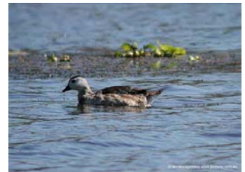
A record number of Cotton Pygmy-geese are currently on Clancy's Lagoon

Visitors are also getting many photo opportunities with the resident Emus ( Dromaius Novaehollandiae ). With the adult male sitting on eggs, the other three have made the area between the Visitor Centre, the new Jabiru Camp and the release pen their home territory. Ever curious, staff and volunteers have been supervised intensely while going about their daily duties!